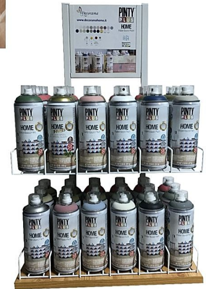
HM 711 ESPOSITORE 36 CONFEZIONI 45x72x25cm.